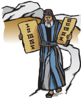
Moses Receives the Ten Commandments